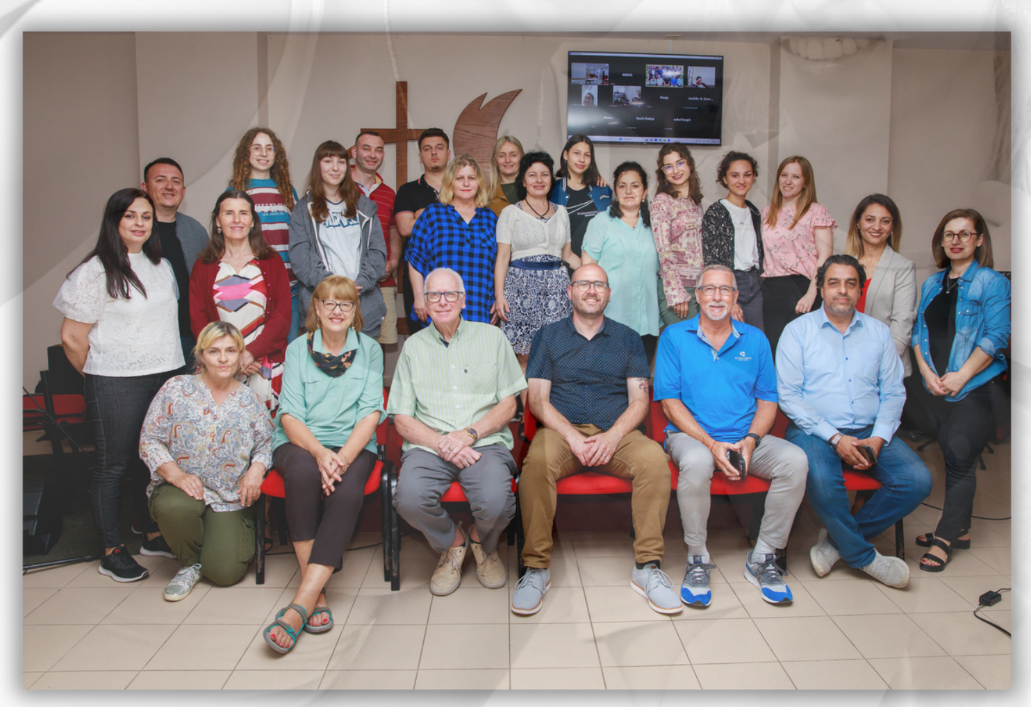
The ISTL Albania Team